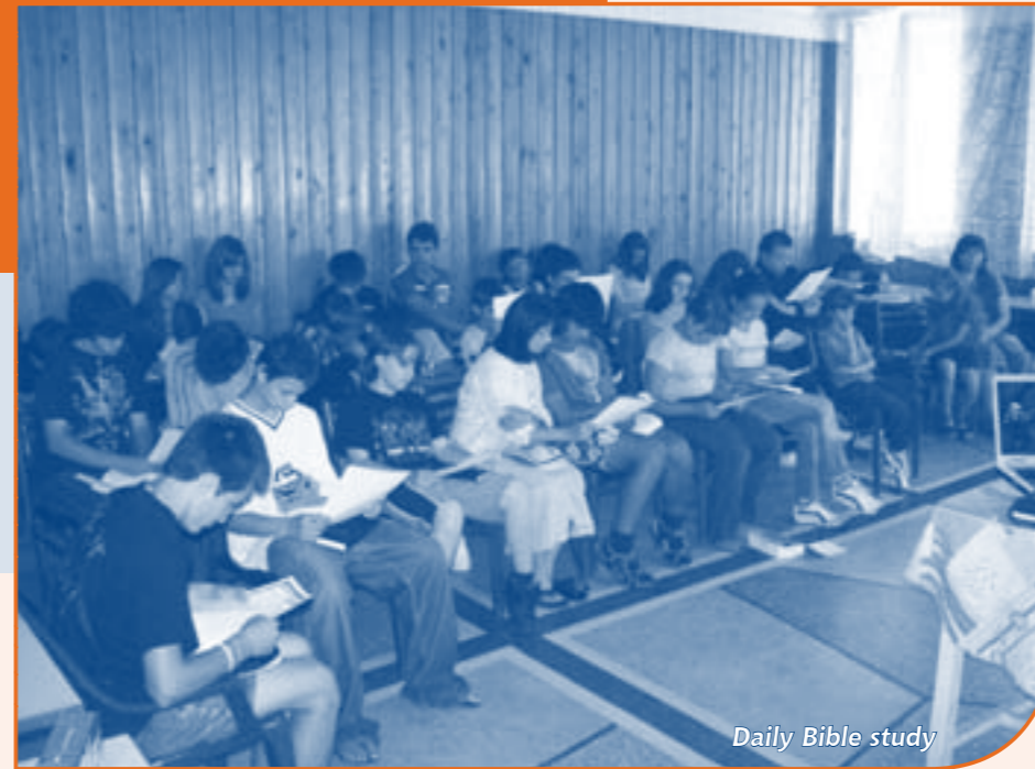
Daily Bible study