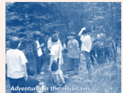
Adventures in the mountains