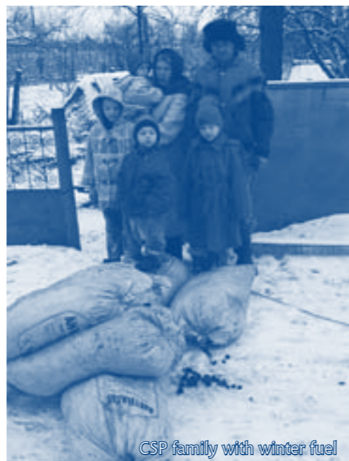
CSP family with winter fuel

Would you help us provide for the needy, and give your Brother and Sister on the other side of Europe a warm winter?